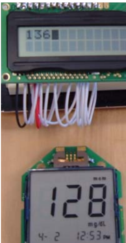
Figure 3, gPod and OneTouch results.

The changes in the code allow the microprocessor to accurately take glucose measurements, display them on the LCD screen, and speak them. The entire circuit works on battery power and is ready to be put onto a printed circuit board. A comparison test with the gPod and OneTouch Ultra showed a difference of 8 mg/dL. The OneTouch Ultra showed a result of 128 mg/dL and the gPod displayed 136 mg/dL. The percent error between the results is 6.25%. Figure 3 shows the gPod and OneTouch Ultra results side by side.