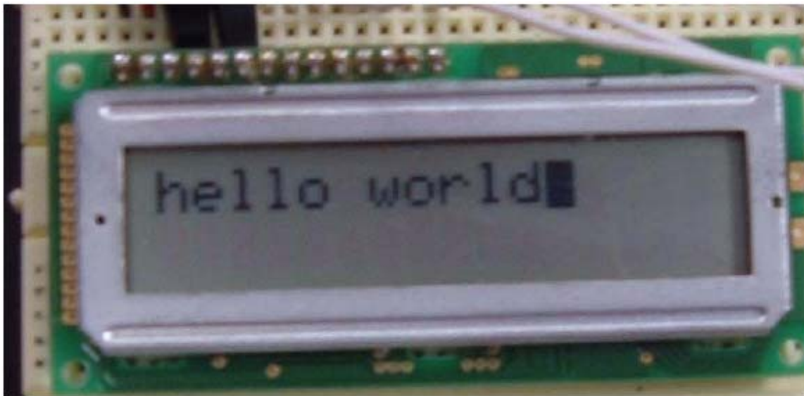
Figure 1, LCD screen displaying “hello world” as commanded by the microprocessor.

Dave worked with the microprocessor to integrate the LCD screen and the speech module. He used some sample code included with the compiler and also some code found from the internet. Initially the code was missing the proper initialization routine to start the LCD screen. Other problems were encountered with the digital outputs on the microprocessor and were resolved by changing the port the output was located on. Figure 1 shows the LCD displaying “hello world” commanded by the microprocessor.