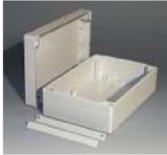
Figure 4: Sample Vial Scanner Enclosure

Finally, Matt researched the components required for a surface mounted circuit. These parts included the op amps, resistors, capacitors, microprocessors, and a new LCD screen. There was also a problem with the speech module we currently had so Matt placed an order for a new module.