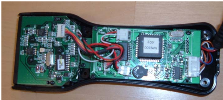
Figure 2: POS-X Xi 1000 Scanner Circuitry

He started by opening up the POS-X Xi 1000 barcode scanner to examine the circuit boards size, as can be seen by Figure 2 below. There were 2 major parts and one minor. There was a circuit board for the sensor and one for the microprocessor. The minor board was just for the button. He took a few quick measurements for finding a suitable casing. Matt also tried to get the scanner to read barcodes using LabView but could not find a VI specifically designed to read from a USB device. More work will be done this week with the barcode scanner.