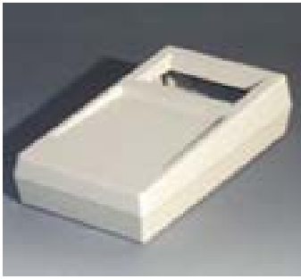
Figure 3: Sample Glucose Enclosure