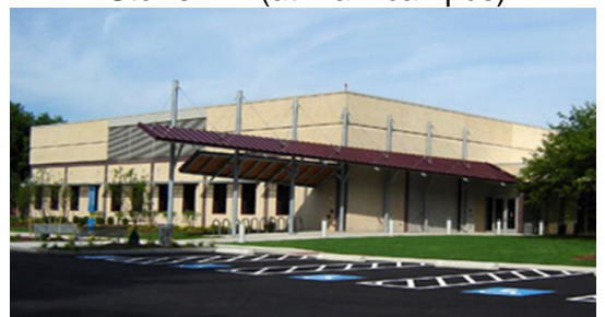
Farmington TIP (at UConn Health)