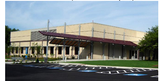
Farmington TIP (at UConn Health)