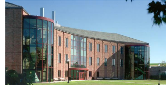
Storrs TIP (at main campus)

The UConn Technology Incubation Program (TIP) helps University-affiliated start-up companies develop and grow. TIP companies are developing new medical devices, drugs and therapies; computer applications, engineering systems, and more. There are >30 TIP companies in incubators at three UConn campuses: