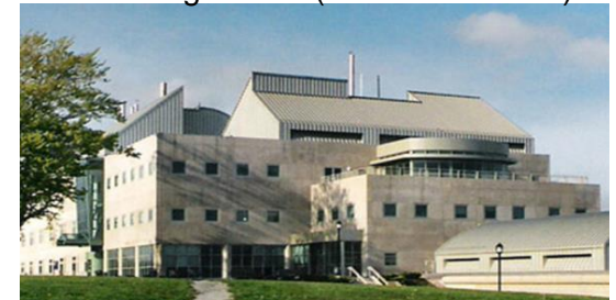
Avery Point TIP (Groton campus)