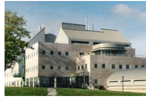
Storrs, Farmington and Avery Point TIP locations (left to right).

Program academic enrichments: Weekly seminars, workshops, networking, and opportunities for research presentations at Intern Research Day, as well as other venues.